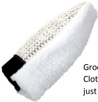
Grooming Cloth (can be just a towel)