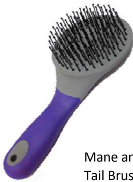
Mane and Tail Brush