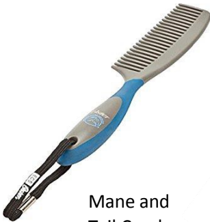
Mane and Tail Comb